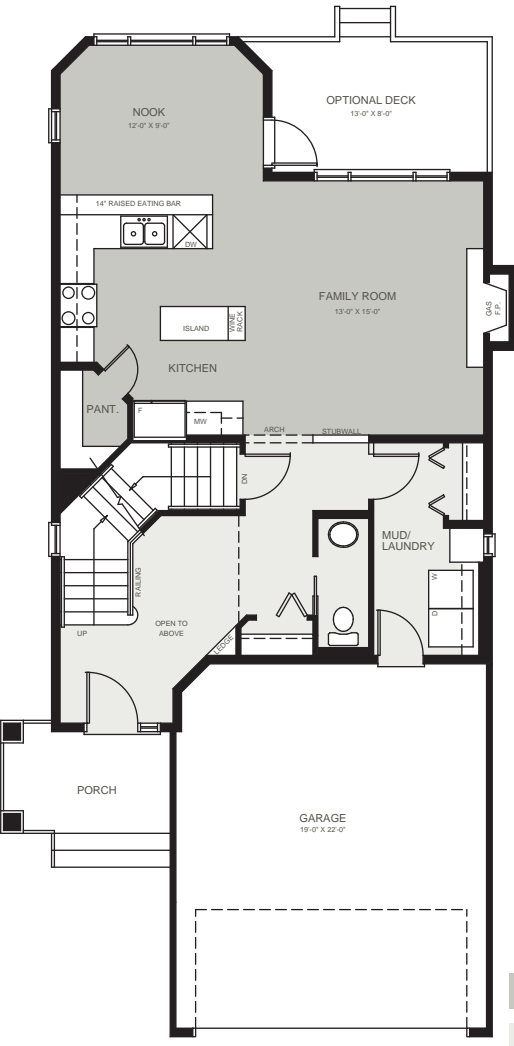
main 886 sq.ft