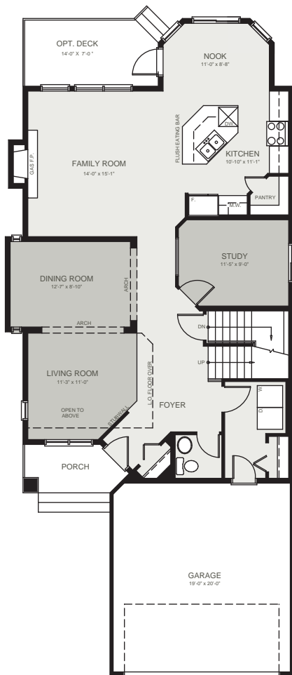
main 1204 sq.ft